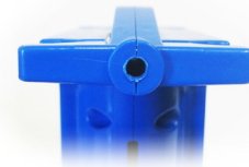
After: 3/16" hole

3. Once the shaft hole is drilled, slide the Hub Quick Connect driveshaft through the nacelle and mount the new Hex Lock on the other end of the driveshaft. Your green hub will fit right into the Hub Quick Connect and your new spool can be mounted using the Hex Locks.