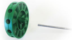
Wiggle and pull out.

2. Next, drill out your nacelle with a 3/16" bit. Whether you use a drill press or a hand-held drill, wear work gloves and hold the nacelle firmly in place. Drill through the existing shaft hole, making sure to go more than half-way through. Turn the nacelle around and drill through the other end of the shaft hole.